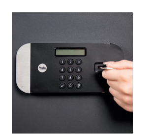
Mechanical over-ride with 1x double bitted key