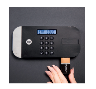
9V battery for emergency power to allow access