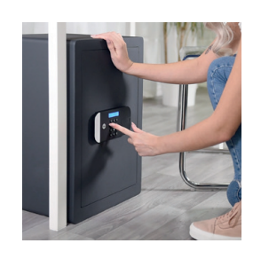
PIN code access