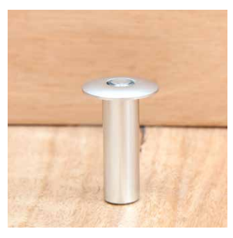
495.26D Satin Chrome