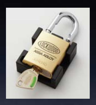
Step 3 Insert a suitable Lockwood shackle back into place. Remove padlock from jig.