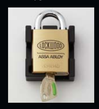
Step 2 Press down on the face of the padlock. The key will turn and release the shackle.